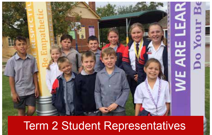
Term 2 Student Representatives