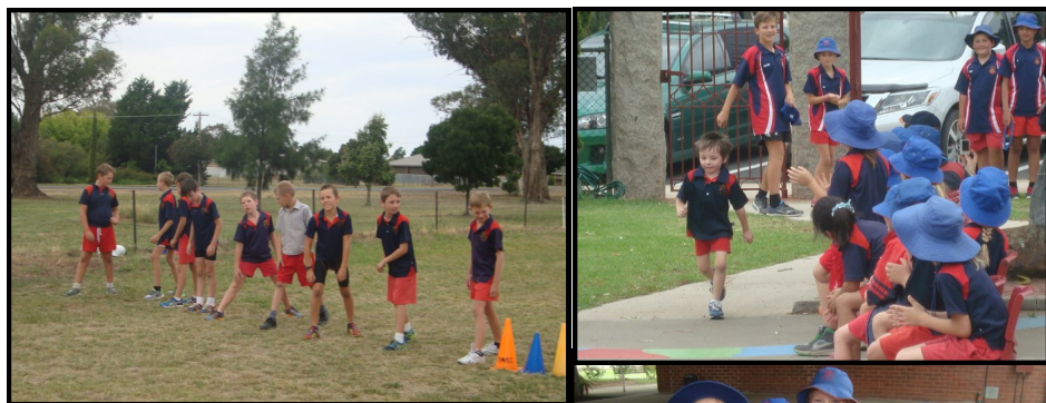
CROSS COUNTRY FUN!