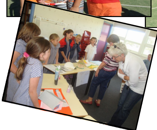
Year 2/3 showcasing their science projects to family & friends.