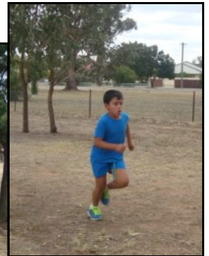
Some sporting snapshots from the last few weeks. Children enjoying the cross country & tennis lessons. on Harmony Day.