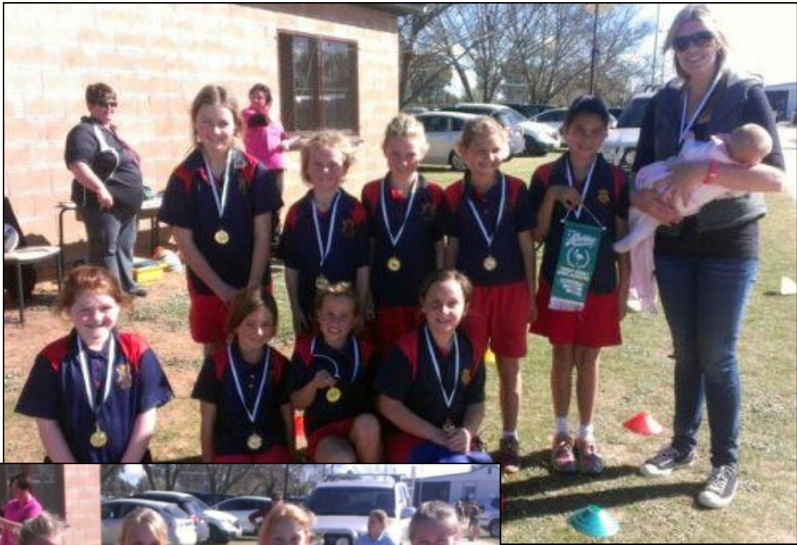
Junior A Team Winners in their division Well Done Girls!