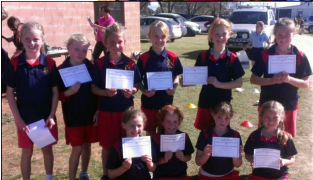
Junior B Blue Team Runners Up in their division Well Done girls!